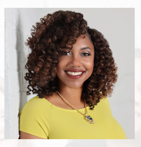
Be a Flamingo in a World of Chameleons: Branding the Uniqueness of You