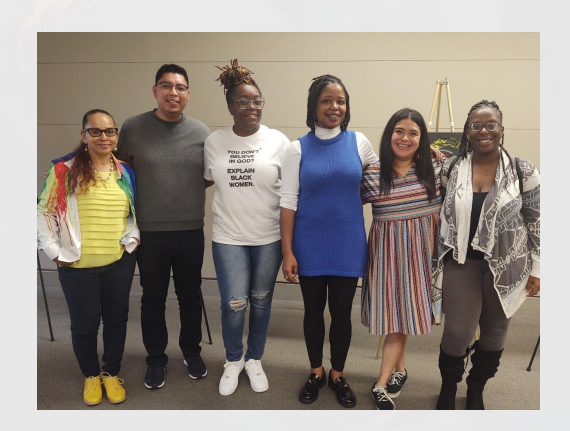
Thanksgiving & Diversity