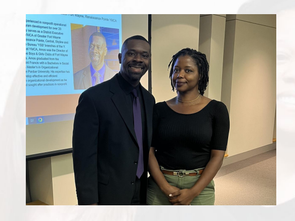
Criminalization & Race