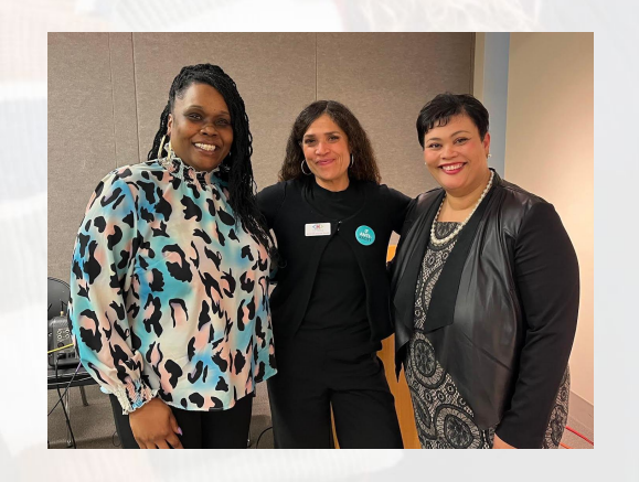
Health Care & Race