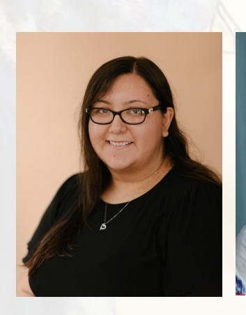
The Power of Positive Gossip