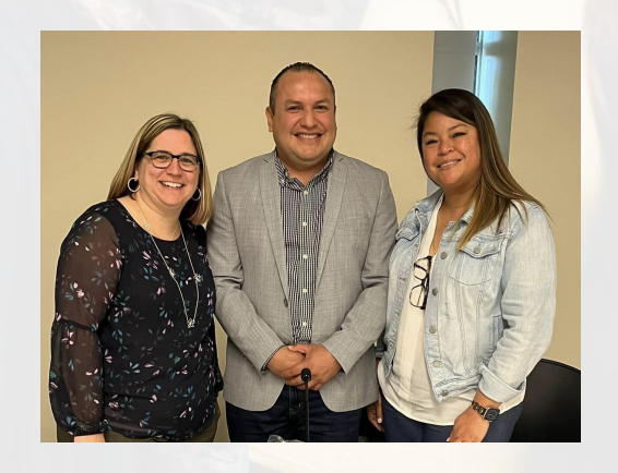
Housing & Race