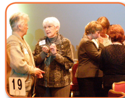
Circle of Women Luncheon attendees visit before the Celebration begins.