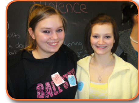
East Noble students participate in TDVAM activities at their high school.

The highlight of our 2011 Black History Month celebration was a special Diversity Dialogue featuring a tour of the African/African-American Historical Museum in Fort Wayne.