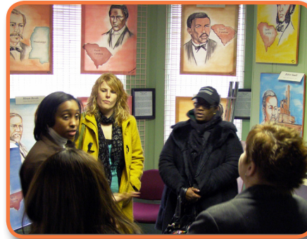
A tour guide talks about Reconstruction-era politicians for Dialogue guests.