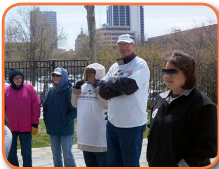
Homeward Bound Walkers raised money for YWCA programs.